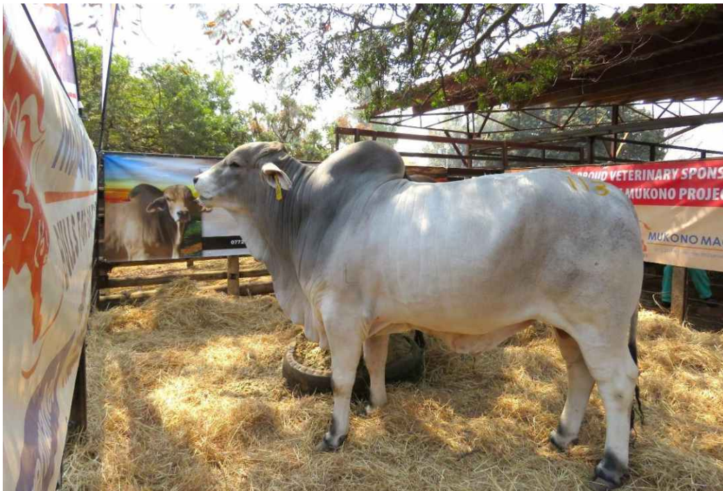
Above: Portelet Estates Brahman, Lot 113, 17/99PE, second highest earner