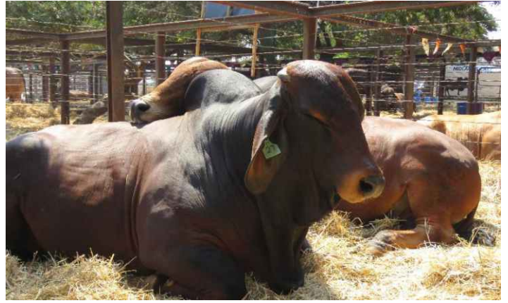
OD Brahmans Lot 108, 17/27OD, above with his handler, and later, having a snooze, proved camera-shy on preview day. He earned third highest price at this year's sale.