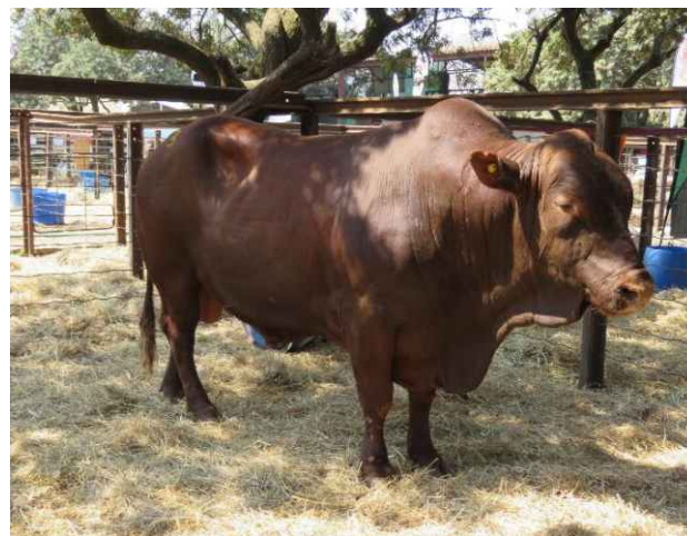
Tuli Bulls – Lot 48, Zviko Tuli, Lot 53, Jambo Tuli.