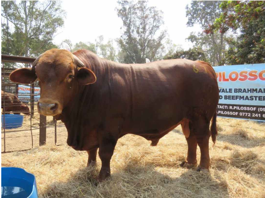
Above: Ruvale Beefmaster, Lot 67, 17/84VR, earned top price

The top price paid was for a Ruvale Beefmaster bull, which sold for ZWL 650,000, followed by ZWL 600,000 for a Portelet Estates Brahman bull. The third highest price of ZWL 590,000 was paid for an OD Brahman bull.