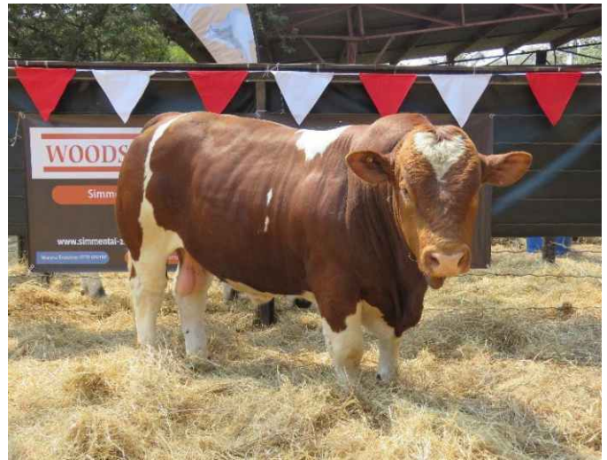
Above, the two outstanding Woodsgift Simmental Bulls, lots 61 and 62, 17-1PJE and 17-15PJE, bred by PJ Erasmus

Bidding for the Beefmaster heifers was strong and the average price was ZWL 203,846, followed by Boran (ZWL 190,000) and Brahman (ZWL 166,972) (see Table 2).