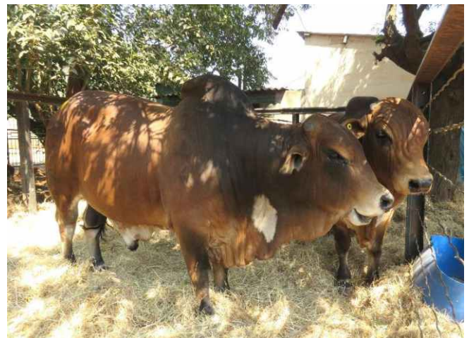
Above: Boran Bulls, Forrester Estate Lot 88, Right, Lots 90 and 91, Hook Borans